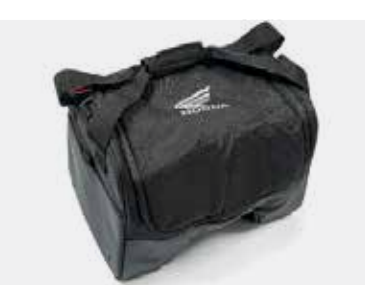
INNER BAG FOR 38-L TOP BOX 08L75-MJP-G51

Black nylon bag with embroidered silver Honda wing logo on the top and red zippers. Comes with adjustable shoulder belt and carrying handle.