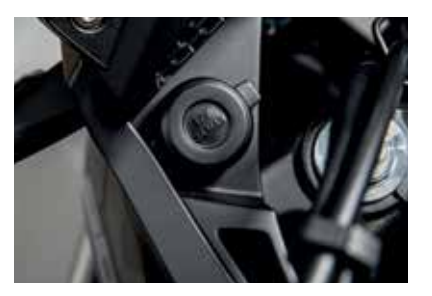
12V SOCKET 08070-MKP-D80 12V Power Socket allows you to power or charge electrical equipment directly from the bike.

Slim heated grips with integrated control unit providing 360° heat around the grips. Features 3-step variable heating levels and an integrated circuit to protect the battery from draining. Attachment and special heat-resistant cement included.