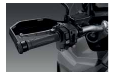
HEATED GRIPS 08T71-MKT-D00

Featuring the X-ADV logo, the deflectors set improves the comfort by reducing the airflow around your waist and your thighs.