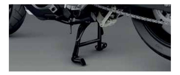
MAIN STAND 08M70-MKW-D00 Facilitates cleaning, rear-wheel maintenance, and more secure parking.