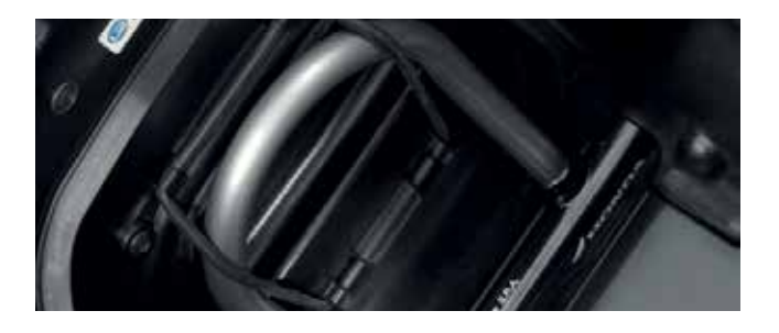
U-LOCK 123/217 08M53-MEE-800 U-Lock with tamper-resistant barrel key.