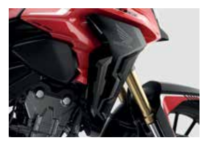
DEFLECTOR KIT 08R71-MKP-J80 Set of black left and right deflectors to protect legs from wind.

Smoked windscreen for improved comfort and a sporty look. Size and shape are identical to the standard clear windscreen.